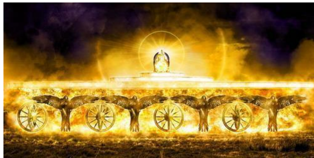
Ezekiel's Traveling Judicial Throne